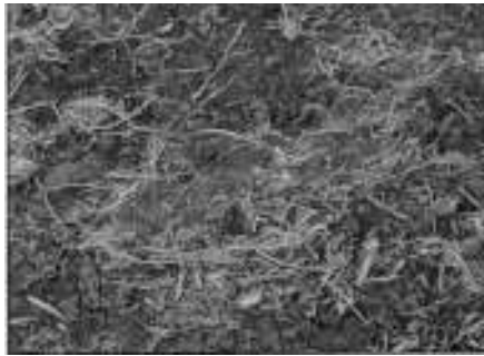
30% Ground Cover

Soil erosion can be substantially reduced, and in some fields controlled, by keeping the land surface partially covered with crop residue. As little as a 30% ground cover (measured immediately after planting) can reduce erosion by 50%.