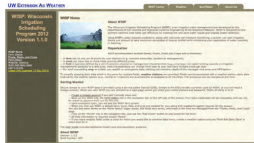
Online WISP program home page

You will need to enter daily reference ET values, irrigation and rainfall amounts, and percent of crop canopy development. To track multiple irrigation systems or fields, you may need to add a page to the spreadsheet program for each irrigation system to be tracked.