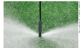
Ron Nichols, USDA-NRCS

Irrigation enhances the quality of many crops by reducing moisture stress. A lack of moisture in a crop can produce misshapen fruit and tubers, poorly filled bean pods or ears of corn, and low protein content in forages. Moisture stress can deter uniform crop maturity, which is important for efficient harvesting of processing vegetables.